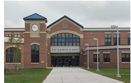
Exeter High School 2006—Present