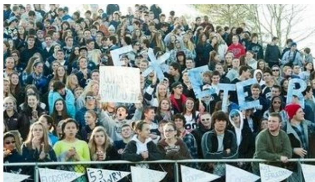
Division I State Football Championship Game

The Exeter High School Alumni Association promotes the welfare of Exeter High School, by raising and distributing donations to Exeter High School, strengthening the ties between Exeter High School Alumni and students and by promoting education, school spirit and good citizenship in both the school and community. We seek to serve as a resource for alumni, current students, faculty and administration, to support the educational mission of Exeter High School, through activities such as career forums, continuing education programs, mentoring and enrichment activities.