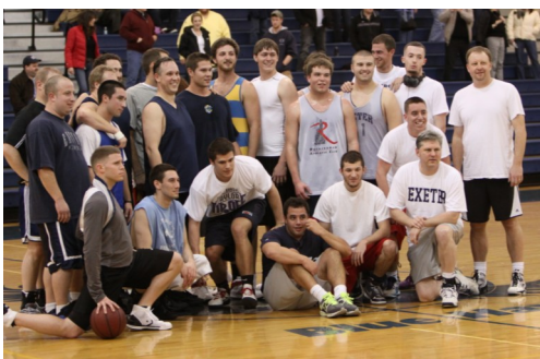
Exeter High School Alumni Basketball Game December 2011

The Exeter High School Alumni Association promotes the welfare of Exeter High School, by raising and distributing donations to Exeter High School, strengthening the ties between Exeter High School Alumni and students and by promoting education, school spirit and good citizenship in both the school and community. We seek to serve as a resource for alumni, current students, faculty and administration, to support the educational mission of Exeter High School, through activities such as career forums, continuing education programs, mentoring and enrichment activities.