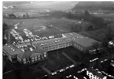
Exeter High School 1912-2006